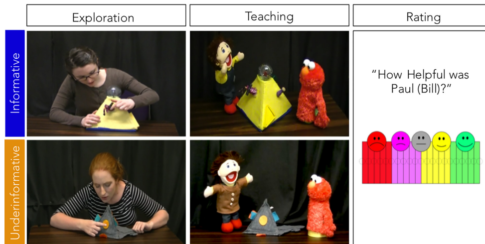
Figure 1. Procedures in Experiments 1 and 2, and the rating scale.

Twenty-eight 6- and 7-year-olds were recruited from a local museum (17 girls; M_{age}(SD) = 7.05(0.54) , range = 6.07–7.90), and were randomly assigned to the informative first condition ( N = 14 ) or the underinformative first condition ( N = 14 ). This sample size was larger than the minimum